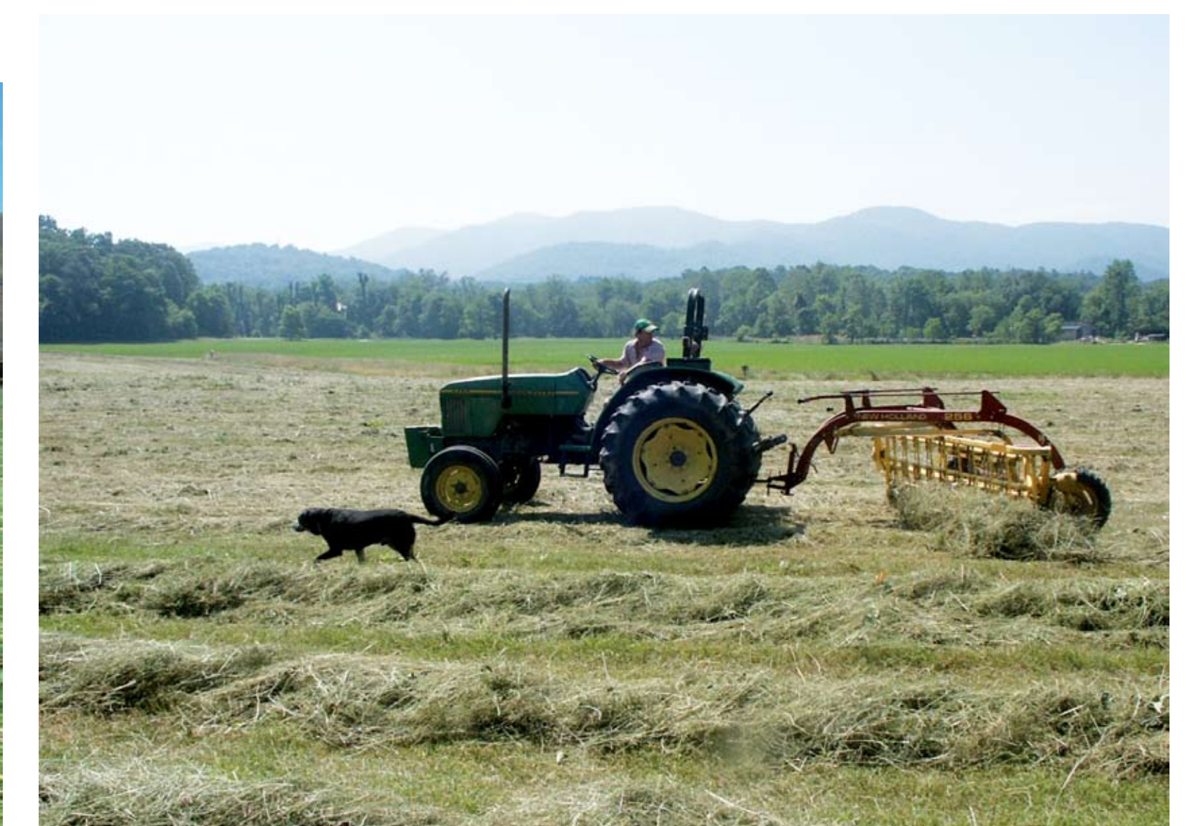
The Farm's major field crops are corn, wheat, barley, and oats, grown in rotation to break the life cycles of pests. Crop yields are 30-50% higher than state averages.