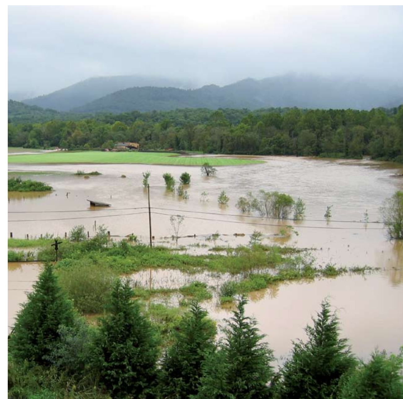
Hurricanes Ivan and Frances submerged parts of campus in 2004.

One of Warren Wilson's greenest acts is to keep all of its farmland in farming. A single acre lost equals thousands of pounds of food the community and its neighbors would have to truck in from somewhere else.