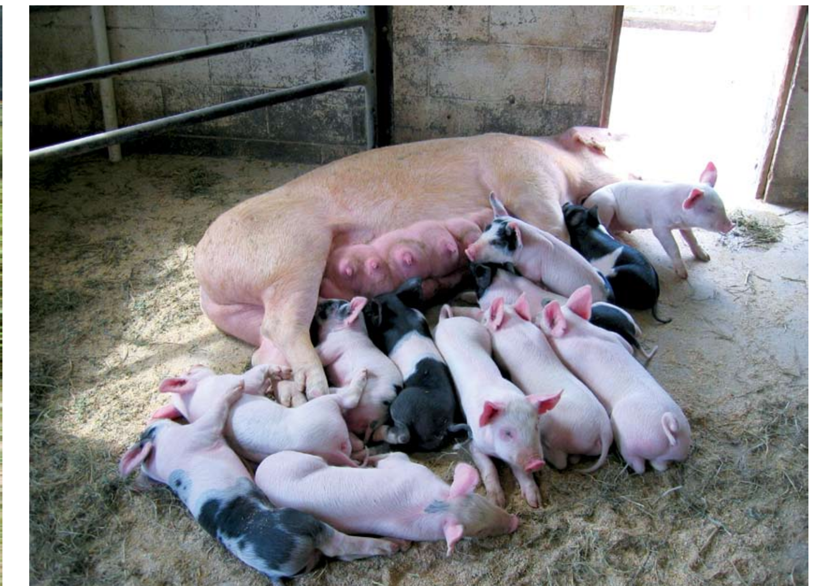
In cold weather, sows farrow in the piggery; in warmer weather, they farrow in pasture farrowing huts. The swine operation provides training for pre-vet students, who perform most of the Farm's veterinary work.