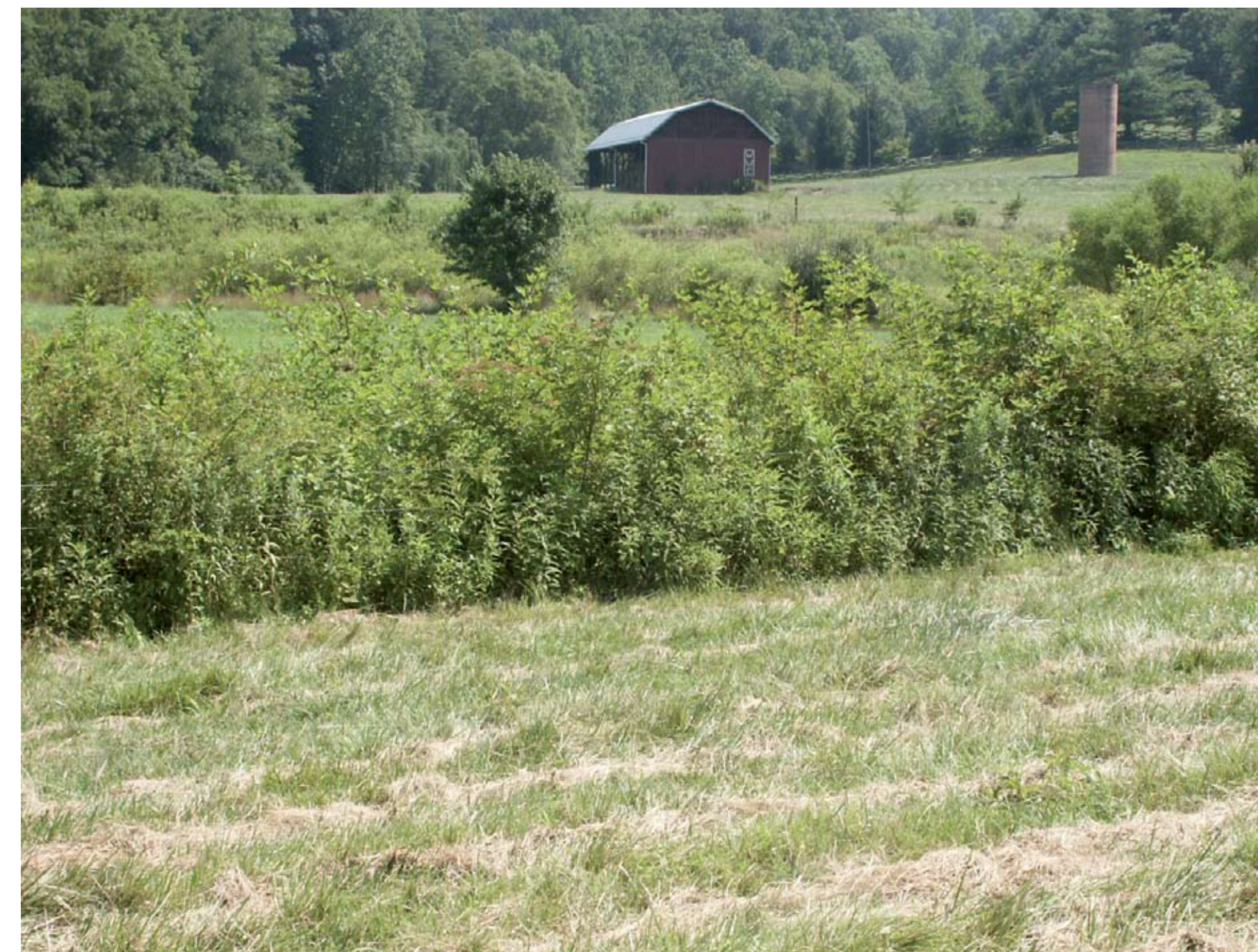
The Farm is a haven for many species of plants and animals and serves as a field research site for environmental studies students.