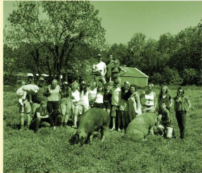
2016/2017 Farm Crew.

As of the close of spring semester 2017, there were 29 students who had declared ENVS: Sustainable Agriculture as their major. Eight of those graduated in May 2017.